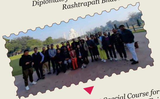
Visit of participants of 1st Special Course for Diplomats from BIMSTEC Countries to Taj Mahal. Agra