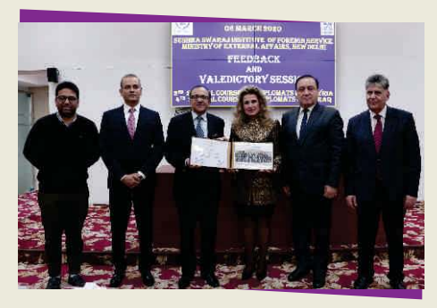
Valedictory session of 3rd Special Course for Diplomats from Syria and 4th Special Course for Diplomats from Iraq.