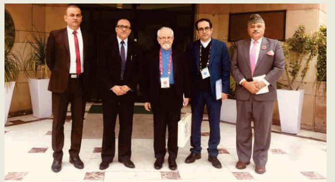
Dr. Seyed Kazem Sajjadpour, Deputy Foreign Minister of Iran visited SSIFS on 16 January 2020 to discuss training of Iranian diplomats at SSIFS.