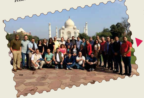
Visit of participants of 3rd Special Course for Diplomats from Syria and 4th Special Course for Iraq to Taj Mahal, Agra