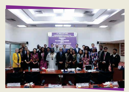
Valedictory session of 2nd Annual D&ISA Fellowship Programme