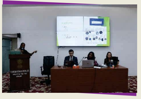
Country presentation by participants of 2nd Annual D&ISA Fellowship Programme