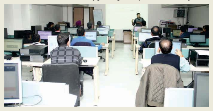
Participants of IVFRT undergoing hands-on training