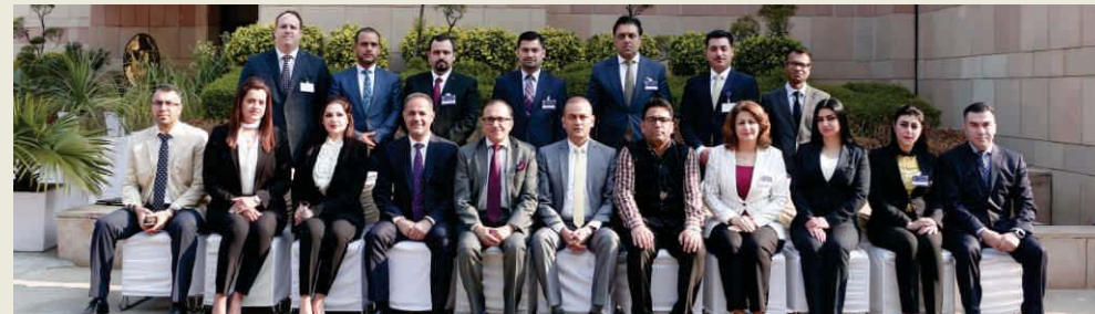
The 4th Special Course for Diplomats from Iraq was organised at SSIFS from 24 February – 7 March 2020. 13 diplomats from Iraq participated in the Course.