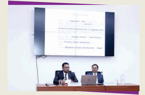
Country presentation by BIMSTEC Secretariat diplomats