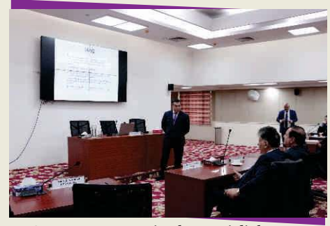
Country presentation by Iraqi diplomats