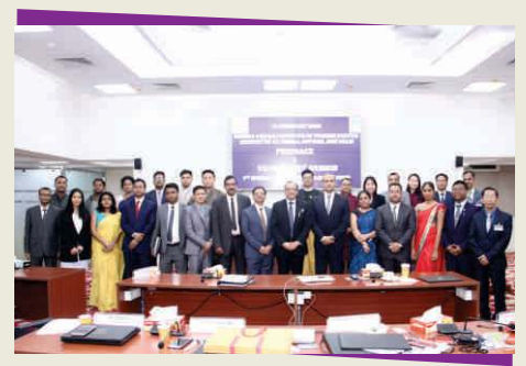
Valedictory session of 1st Special Course for Diplomats from BIMSTEC Countries