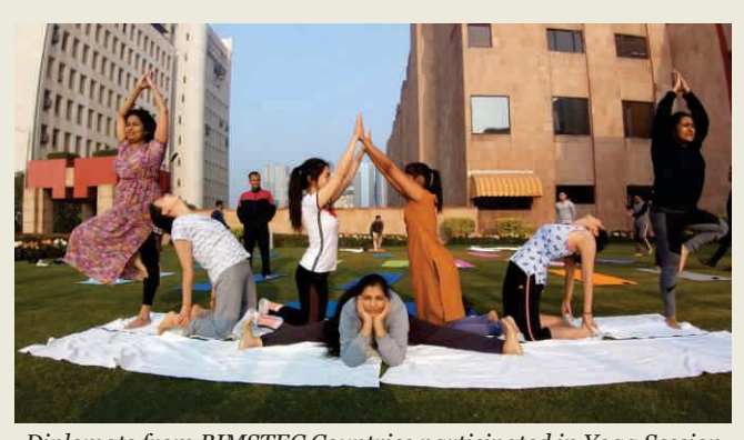
Diplomats\ from\ BIMSTEC\ Countries\ participated\ in\ Yoga\ Session