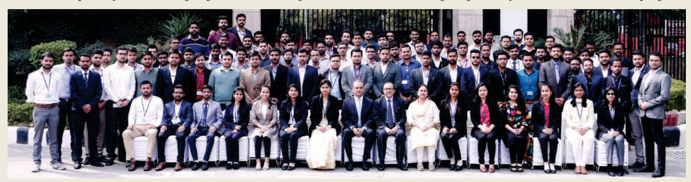
Induction Training Programme for 92 new Direct Recruit ASOs was organised at SSIFS.