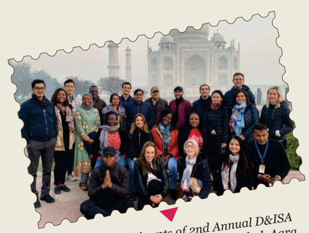
Visit of participants of 2nd Annual D&ISA Fellowship Programme to Taj Mahal, Agra