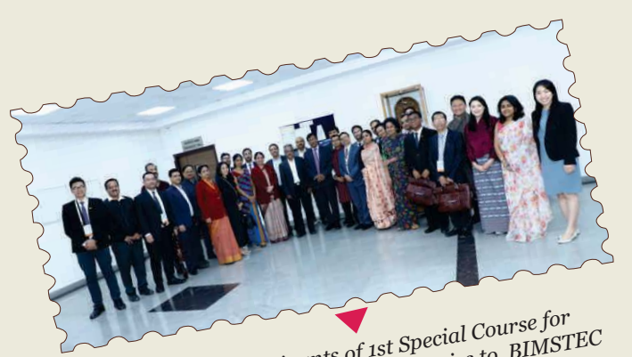
Visit of participants of 1st Special Course for Diplomats from BIMSTEC Countries to BIMSTEC Diplomats from Weather and Climate, Noida Centre for Weather