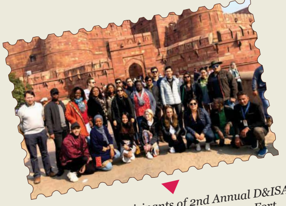
Visit of participants of 2nd Annual D&ISA Fellowship Programme to Agra Fort